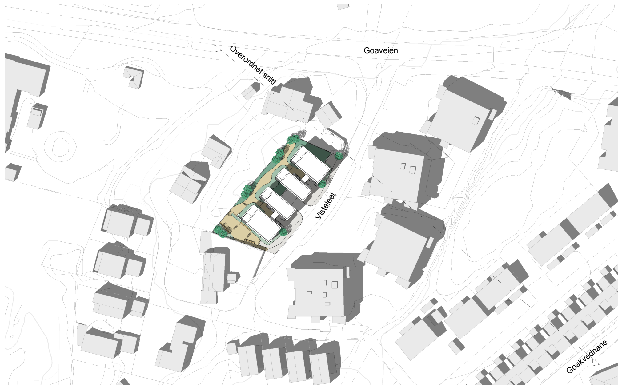
Situasjonsplan 1000 1 : 1000